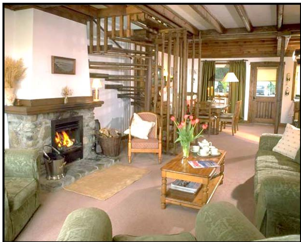
Jura Cottage interior